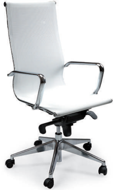
KIRA net EXECUTIVE CHAIR