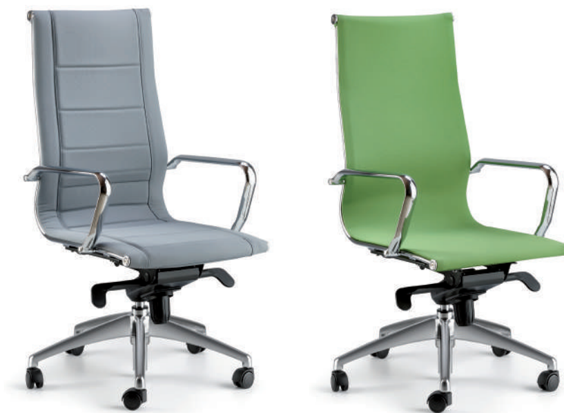
KIRA EXECUTIVE CHAIR